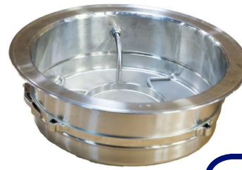
Sieve with waveguide and resonator.