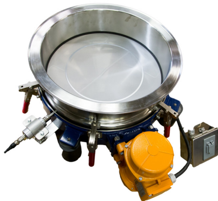
Sieve unit shown internally with ultrasonic converters and resonating frame.