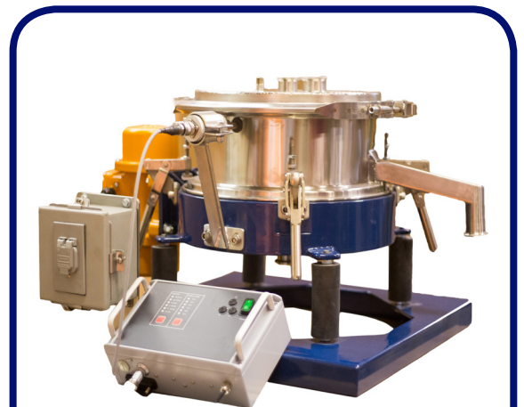
Model RVM-15E with SFA® removable Ultrasonic deblinding transducer and generator, shown mounted to a US230 mesh stainless steel screen. Three stainless steel contact parts including: center discharge funnel, sieve & inline cover.