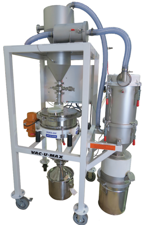
Model RVM-15E with Vac-U-Max® vacuum feed recovery system.